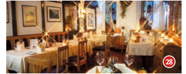
Stainzerbauer Bürgergasse 4 T 821106, stainzerbauer.at