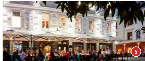
Dreizehn by Gauster Franziskanerplatz 13 T 838567, dreizehnbygauster.at