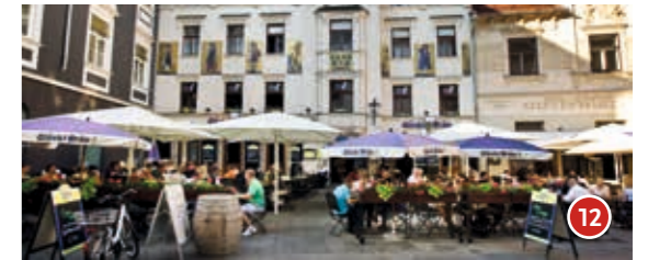
Glöckl Bräu Glockenspielplatz 2-3 T 814781, gloecklbraeu.at