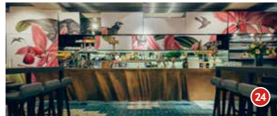
Promenade – Cafe – Tapasbar Erzherzog Johann Allee 1 T 813840, daspromenade.at