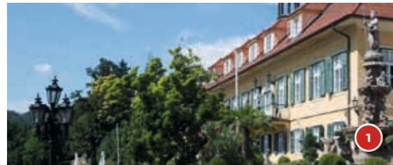
Aiola im Schloss Andritzer Reichsstraße 144 T 890335, schloss.aiola.at