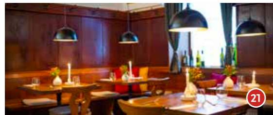
Mohrenwirt Mariahilferstraße 16 T 904440, mohrenwirt-graz.at