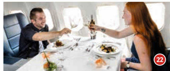
Nova Air im Hotel Novapark Fischeraustraße 22 T 682010-724, novapark.at