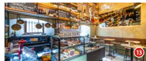
Goldkost Landhausgasse 1 T 830083855, goldkost.at