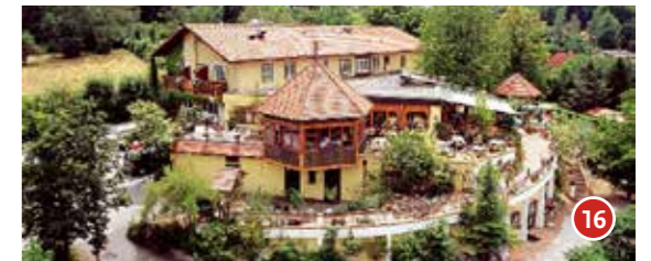
Häuserl im Wald Roseggerweg 105 T 391165, legenstein-hiw.at