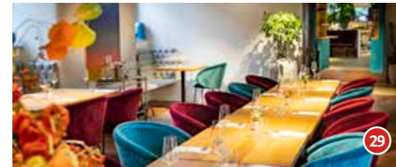
Stammtisch am Paulustor Paulustorgasse 8 T 813803, stammtisch.restaurant