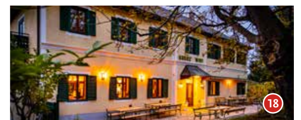
Kreuzwirt am Rosenberg Saumgasse 39 T 676458, kreuzwirtamrosenberg.at