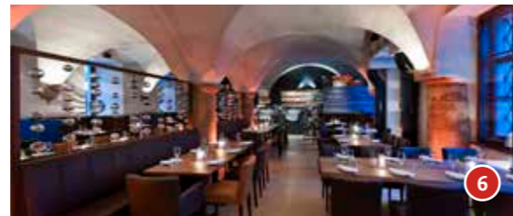
El Gaucho im Landhaus Landhausgasse 1 T 830083, elgaucho.at