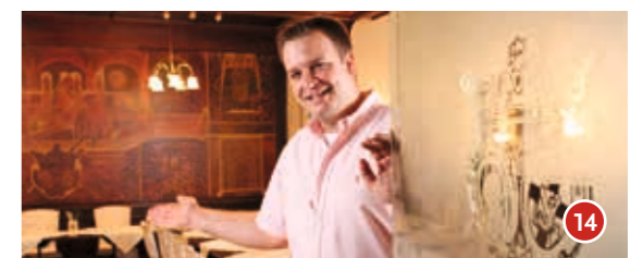
Gösser Bräu Neutorgasse 48 T 829909, goesserbraeugraz.at