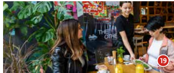
Kunsthauscafé Graz Südtirolerplatz 2 T 714957, kunsthauscafe.co.at