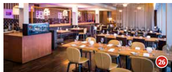
Restaurant Schlossberg Schlossberg 7 T 840000, schlossberggraz.at