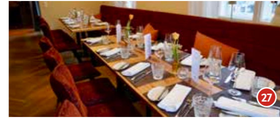
Schanzwirt Leonhardplatz 4 T 228793, schanzwirt.at