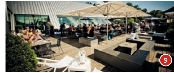
Freiblick – Tagescafe Sackstraße 7-13 T 835302, freiblick.co.at