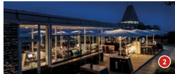
Aiola Upstairs Schlossberg 2 T 818797, upstairs.aiola.at