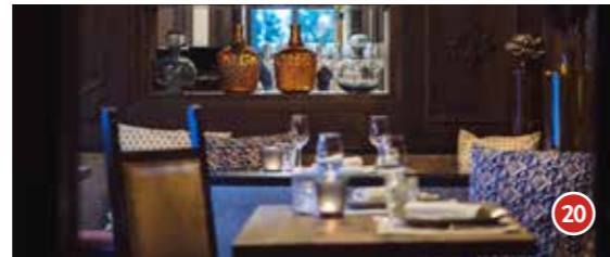
Landhauskeller Schmiedgasse 9 T 830276, landhaus-keller.at