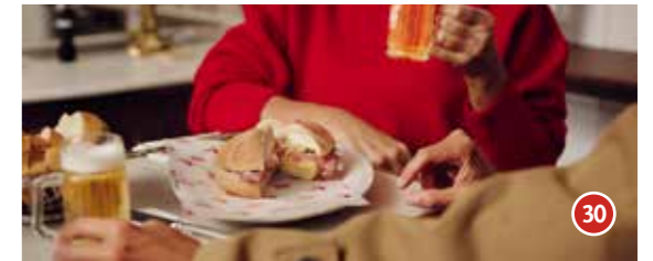
Steirer-Theke im Restaurant „Der Steirer“ Belgiergasse 1 T 703654, der-steirer.at