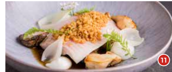
Geniesserei am Markt Kaiser-Josef-Platz 27/29, Marktstand 23/25 T +43 (0) 664/9211005, geniessereiammarkt.at