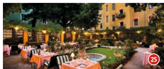
Restaurant Florian im Parkhotel Graz Leonhardstraße 8 T 363060, parkhotel-graz.at