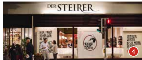
Der Steirer Belgiergasse 1 T 703654, der-steirer.at