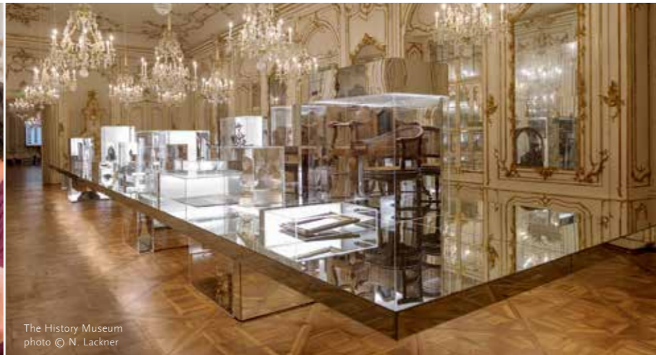
The History Museum