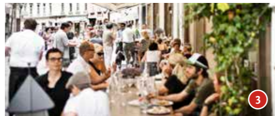
Delikatessen Frankowitsch Stempfergasse 2-4 T 822212, frankowitsch.at