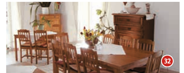
Zur Steirerstub'n Lendplatz 8 T 716855, steirerstubn.at