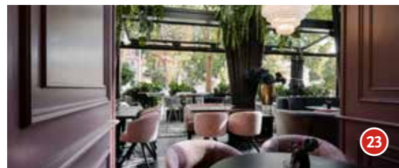
Operncafe Opernring 22 T 830436, operncafe.at