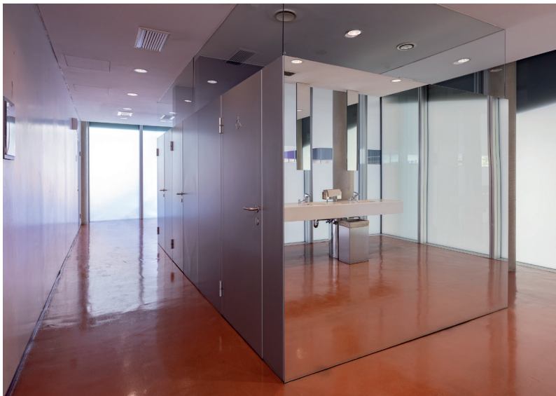
Barrier-free WC Messecongress Süd