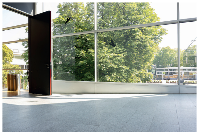
Transition to Messecongress Nord