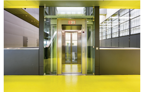
Lift Halle A