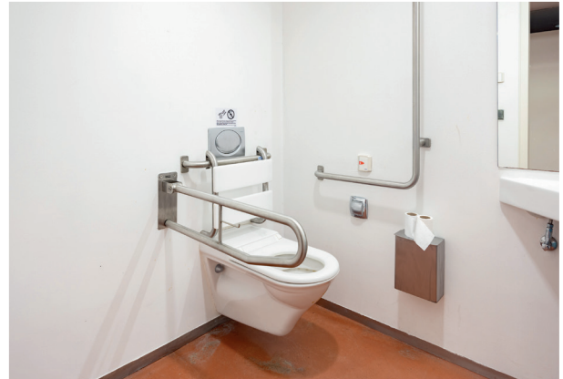
Barrier-free WCs basement