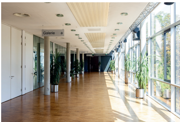
Interior Messecongress Nord