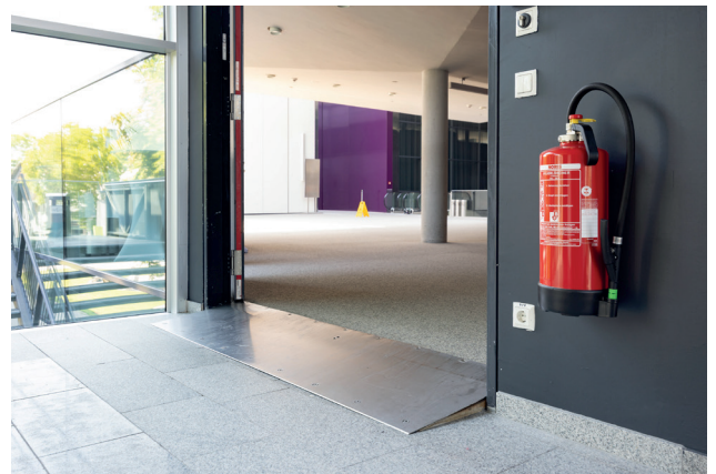
Transition to Messecongress Nord