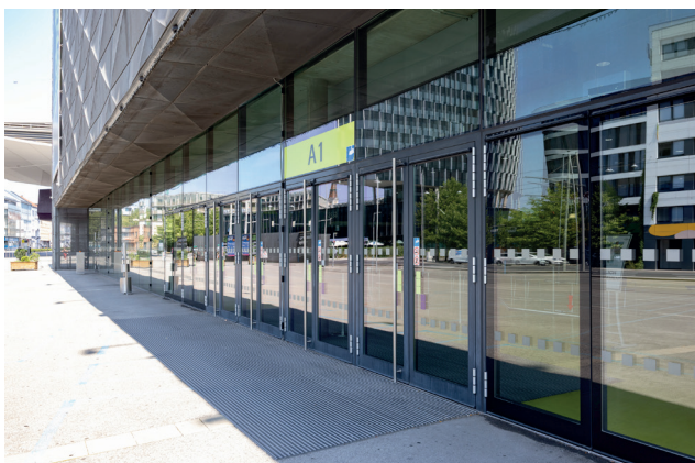
Entrance Halle A