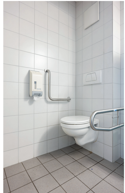
Barrier-free WC Messecongress Nord