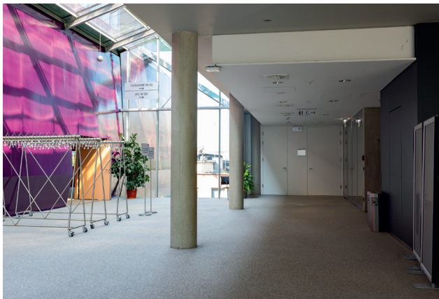
Interior Messecongress Süd