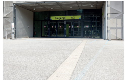
Entrance Halle A