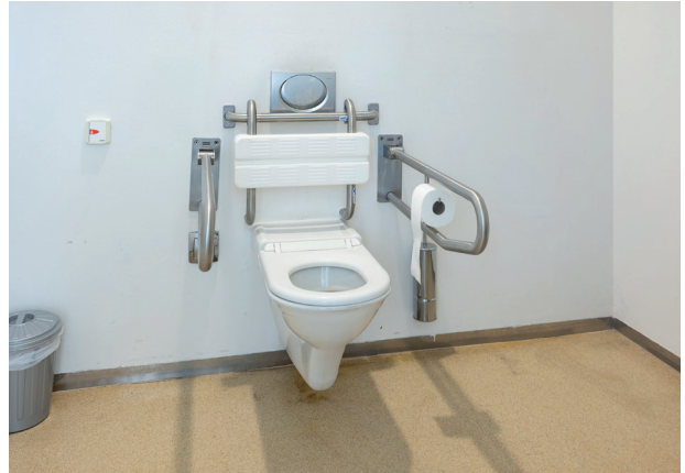
Barrier-free WC ground floor