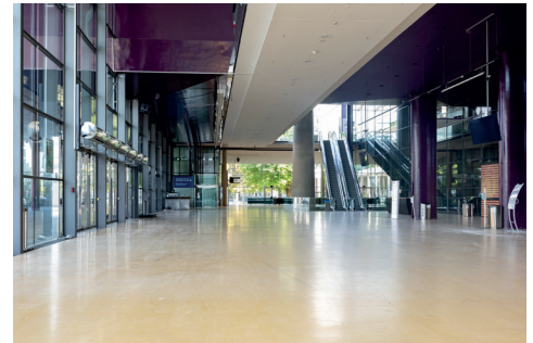
Interior Area, Foyer