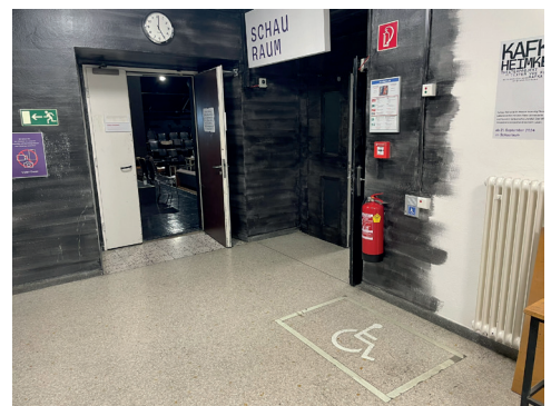
Space for wheelchair users at the Schauraum