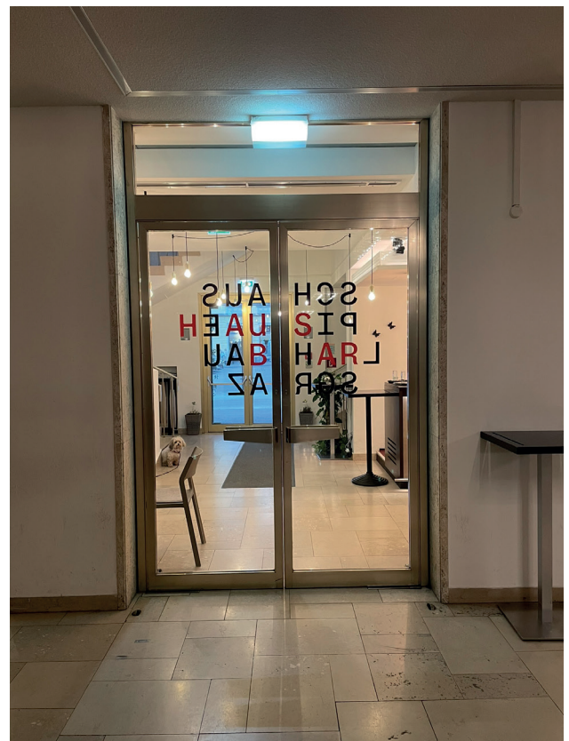
From the café to the foyer