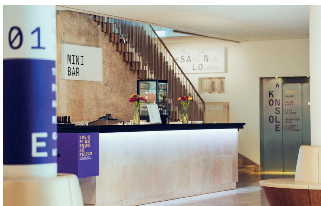
Bar in the foyer