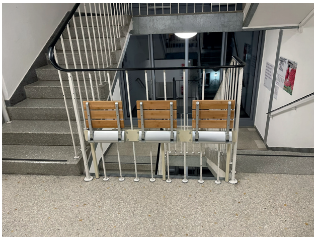
Staircase and folding seats