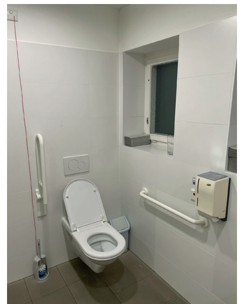
Barrier-free WC 3 rd floor