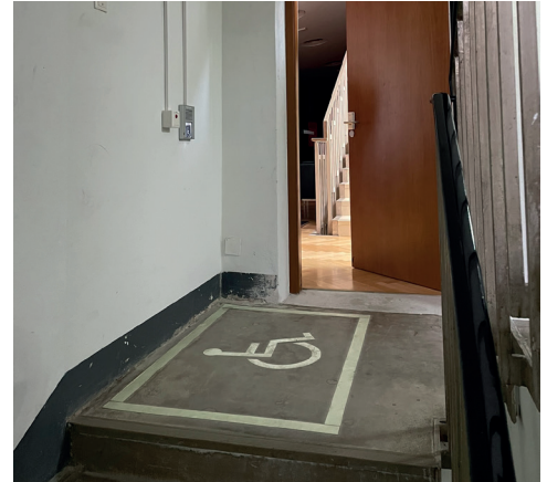
Space for wheelchair users at the Schauspielhaus