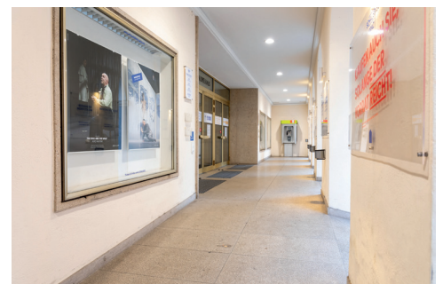
Ramp to main entrance