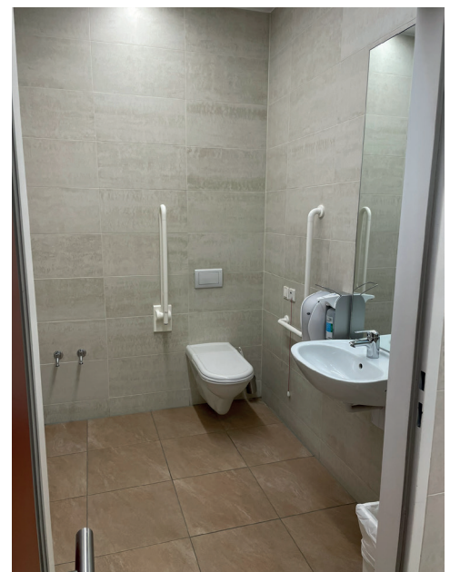
Barrier-free WC in the foyer