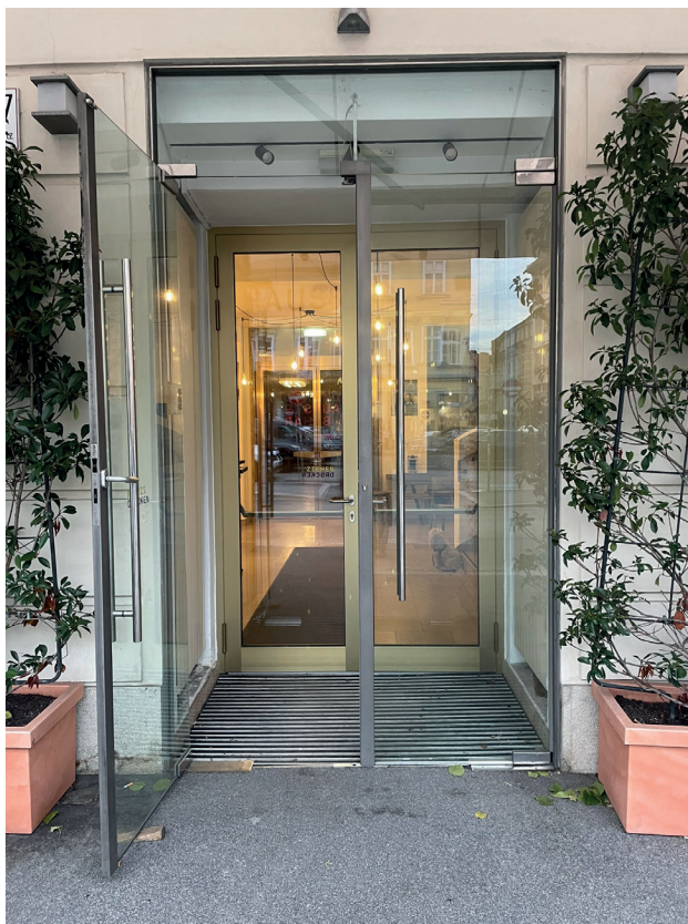
Entrance via the café