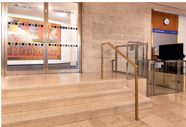
Lifting platform and steps to the seats on the ground floor