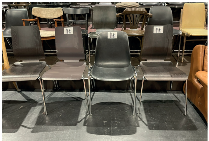
Wheelchair spaces or seats with extended legroom (variable)