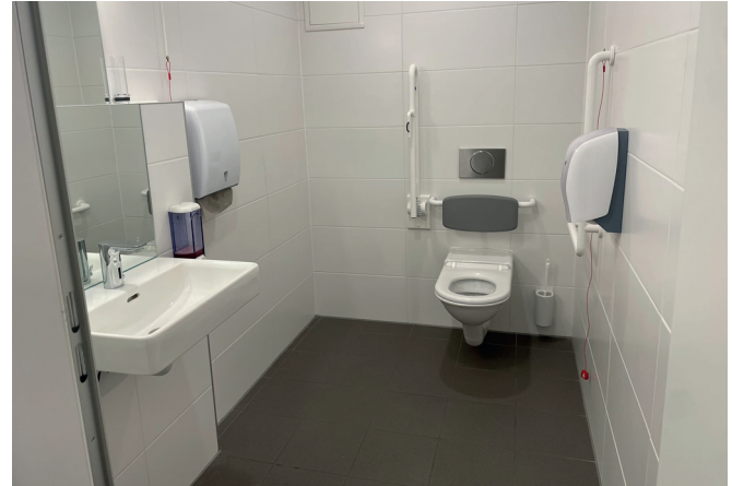
Barrier-free WC 1 st floor