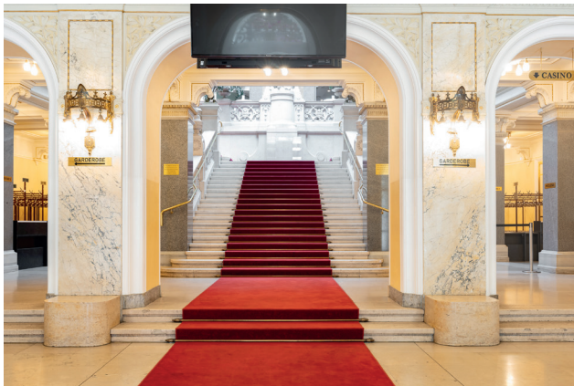
Foyer with grand staircase