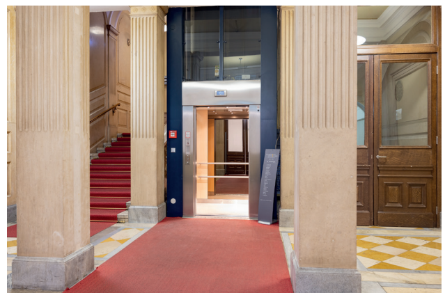
Lift and staircase