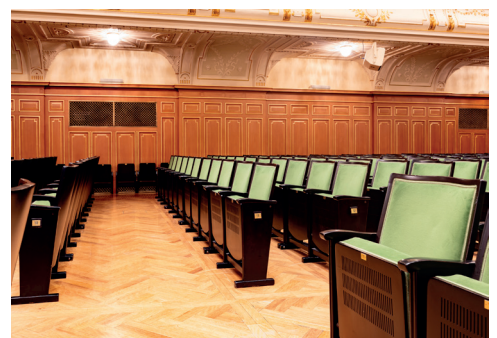
Row with extra legroom