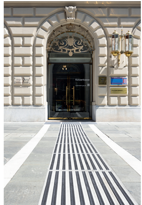
Tactile floor guidelines