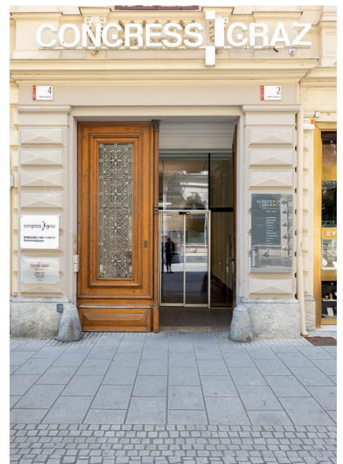
Entrance at Schmiedgasse