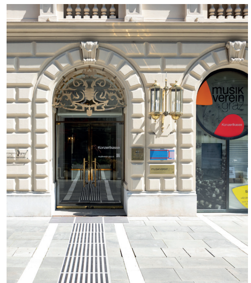
Entrance at Sparkassenplatz