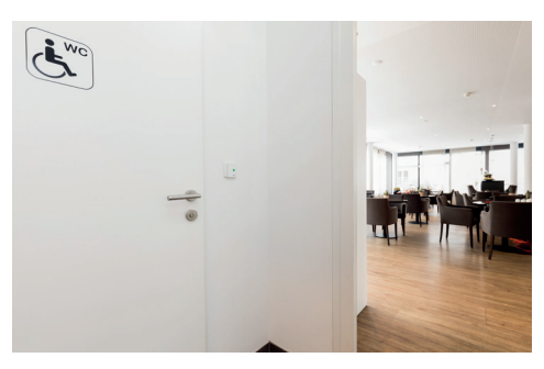
General barrier-free WC