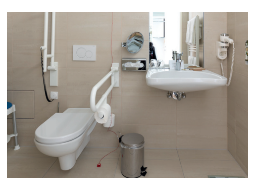
Bathroom: Suite 002