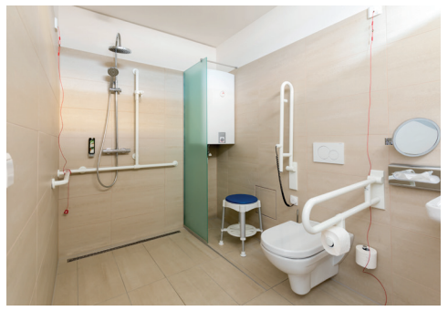
Bathroom: Suite 002