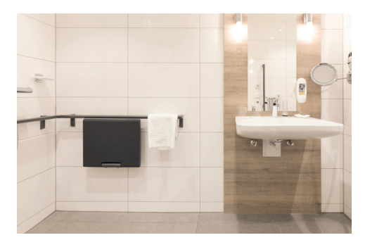
Bathroom Barrier-free room no. 417