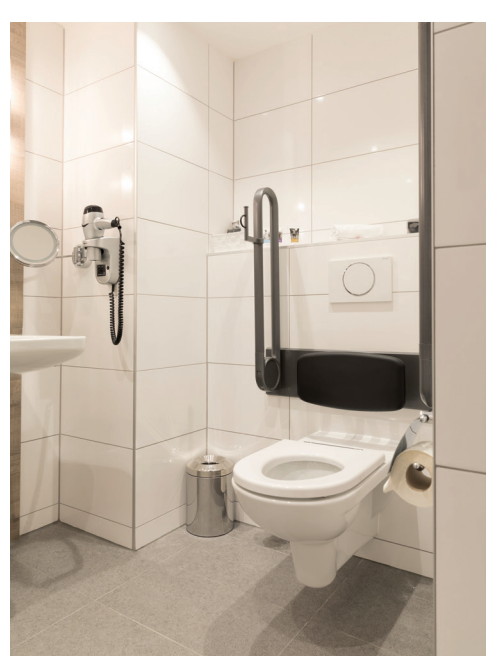
Bathroom Barrier-free room no. 417