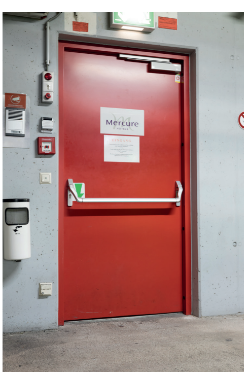
Hotel access from the underground parking garage