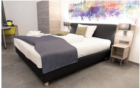
Barrier-free room no. 417