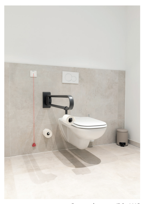
General accessible WC