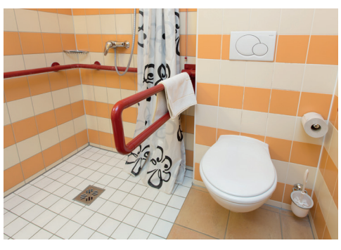
WC in bathroom