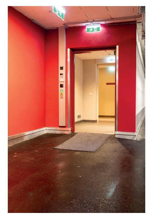
Access from underground car park to the hotel