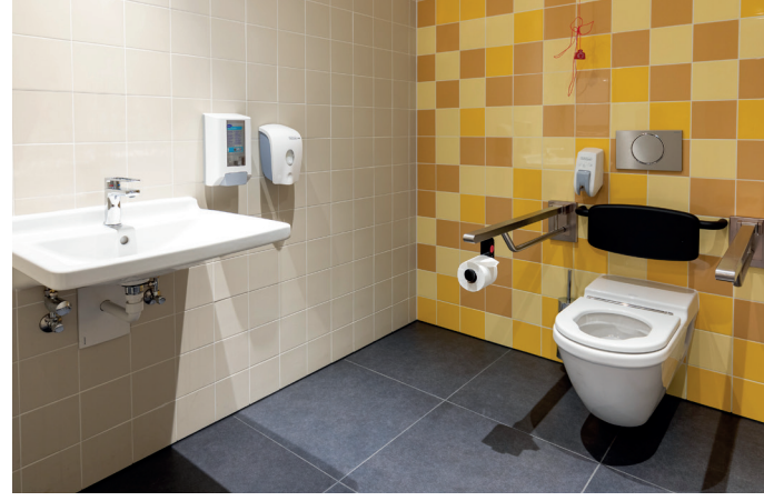
General accessible WC