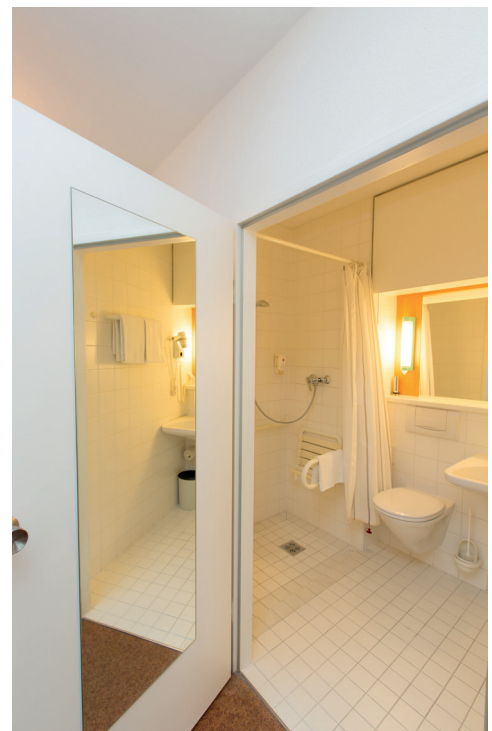
Entrance to bathroom in room