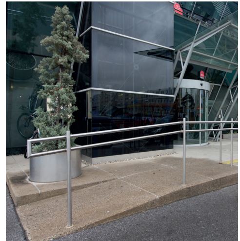
Ramp to hotel entrance