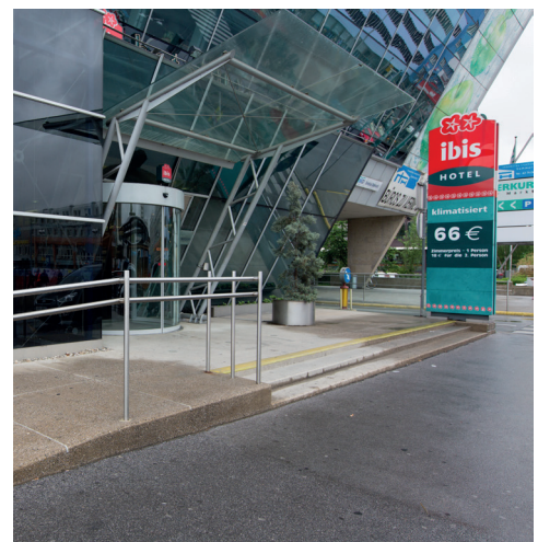
Steps to hotel entrance