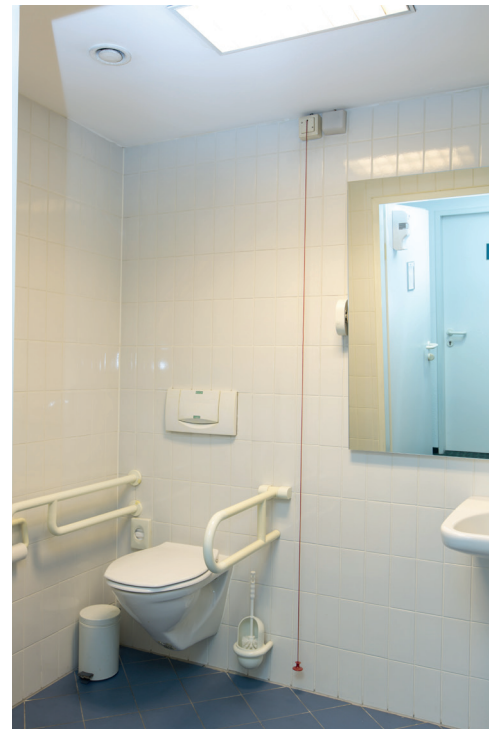
General accessible WC