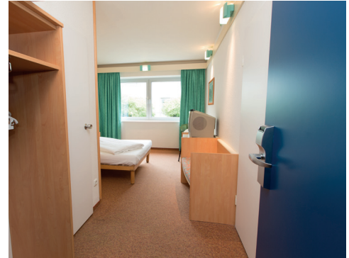
Entrance in room