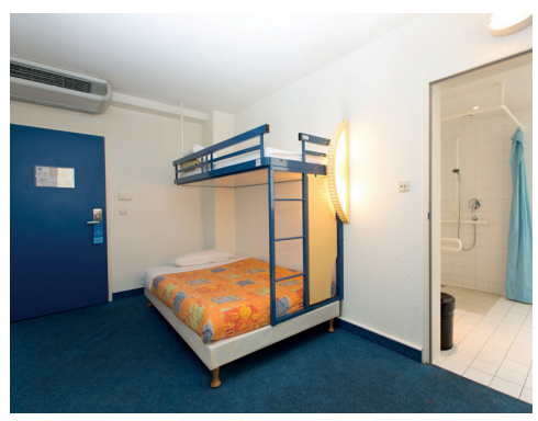
Room with entrance to bathroom