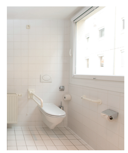
WC in bathroom

• Emergency bell can be reached from the WC when sitting