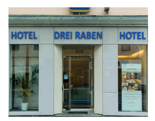
HOTEL www.grazton DREI RABEN (THREE RAVENS)

Graz Tourismus und Stadtmarketing GmbH Messeplatz 1/Messeturm 8010 Graz | Austria T +43 316 8075 0 www.graztourismus.at