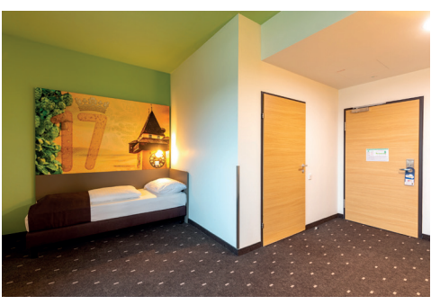
Room no. 101