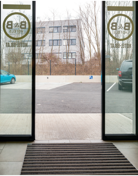
Parking and access to the hotel