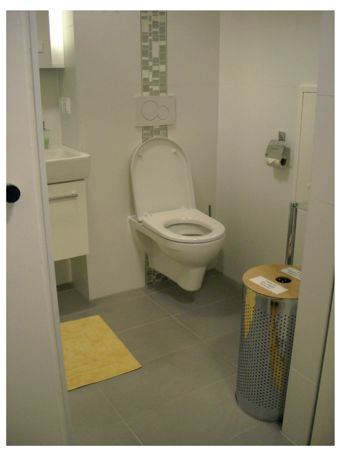
Entrance to bathroom

Messeplatz 1/Messeturm 8010 Graz | Austria T +43 316 8075 0 www.graztourismus.at