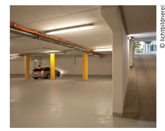
Underground car park