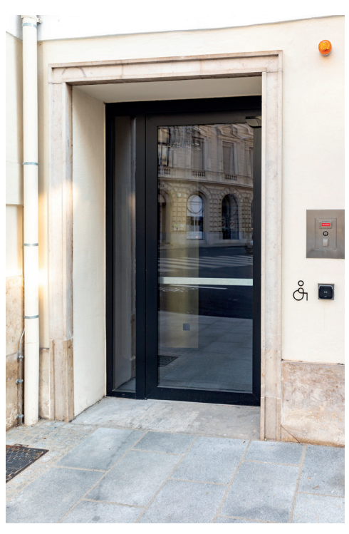
Accessible side entrance