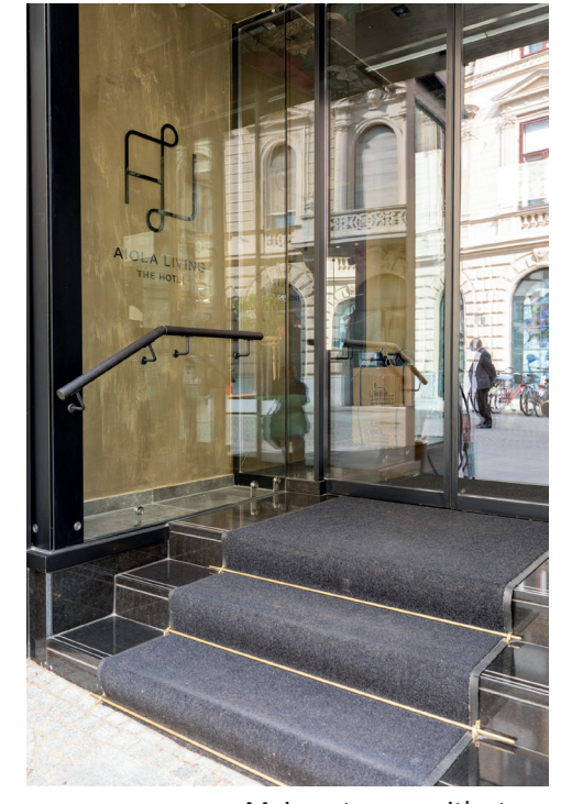
Main entrance with steps