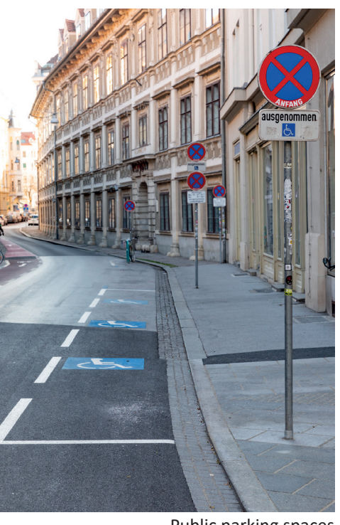
Public parking spaces