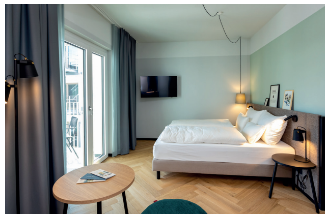
Barrier-free room no. 503