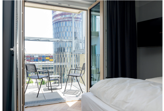
Balcony room no. 503