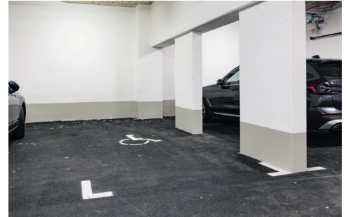
Barrier-free car park