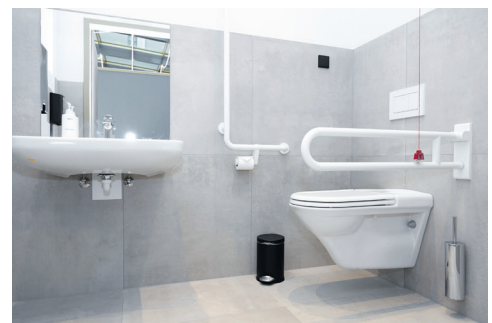
General barrier-free WC