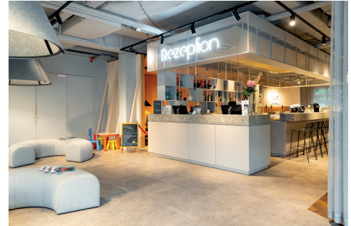
Reception & lobby