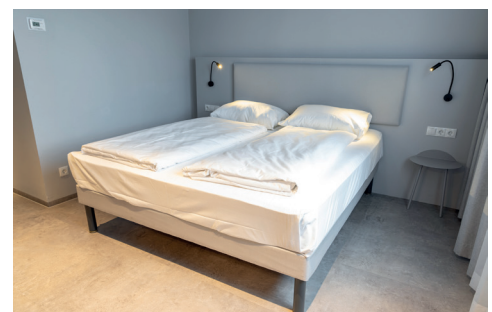
Barrier-free room no. 128