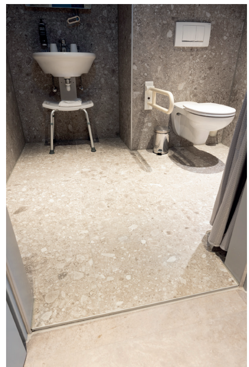
Bathroom room no. 128