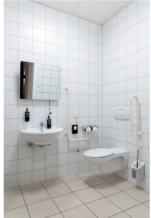
General barrier-free WC