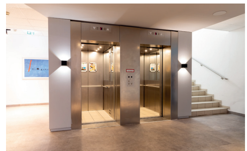
Lift and staircase