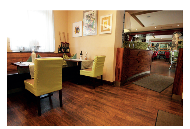
ramp 10-12% gradient