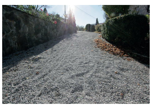
Access WC and outdoor dining area