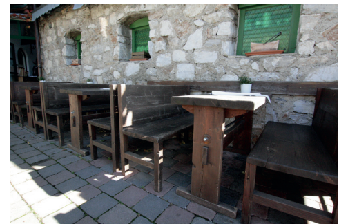
Outdoor dining area