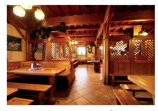
Guest room 1