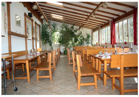
Guest room 2