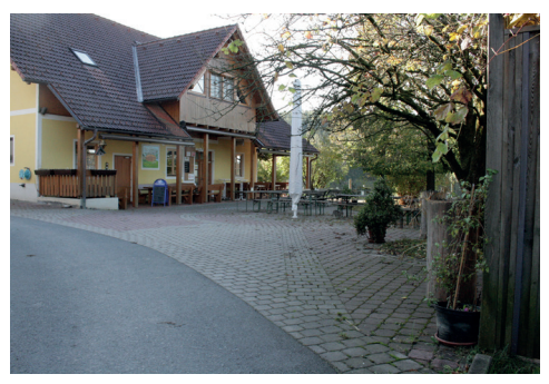
Access and accessible parking