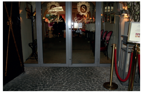
Accessible entrance, non-smoking area