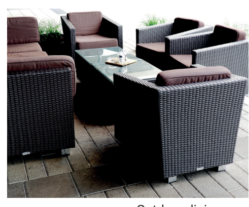
Outdoor dining area