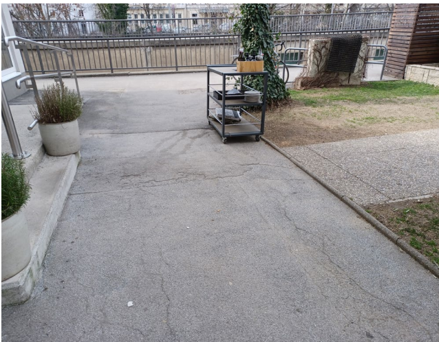
Transition to outdoor dining area