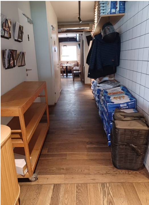
Access to WC