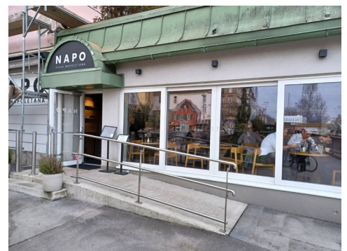
Entrance with ramp