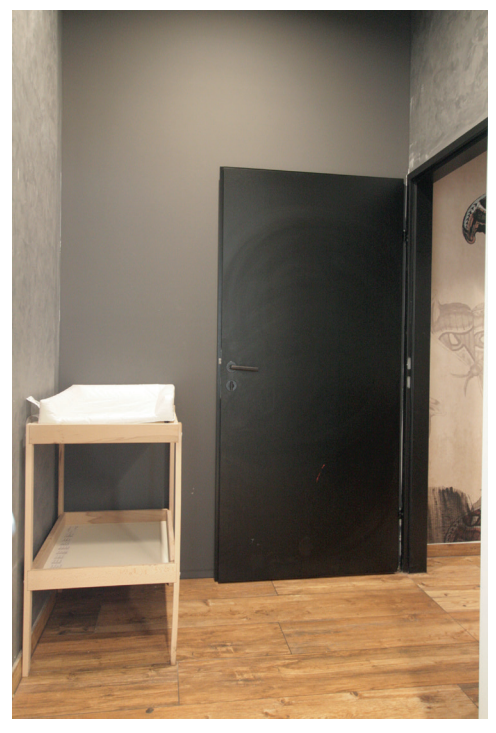
Entrance area accessible toilet