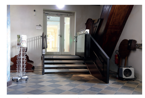
Stair lift to St. Anthony's Church