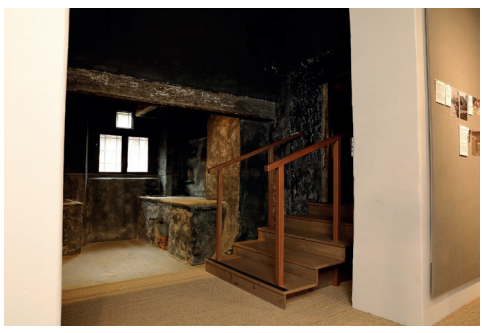
Historic "smoke kitchen"