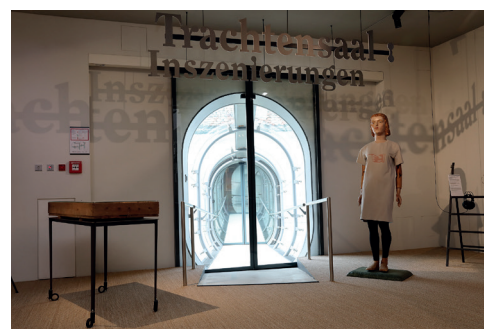
Ramp to "Trachtensaal"