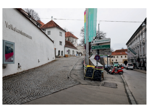
Path from Paulustorgasse