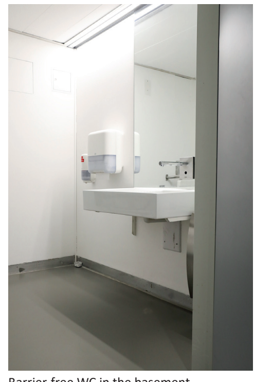
Barrier-free WC in the basement