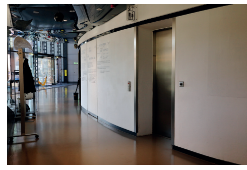
Lift to exhibition