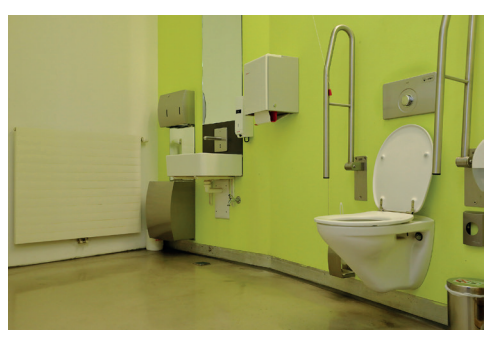
Barrier-free WC 2nd floor