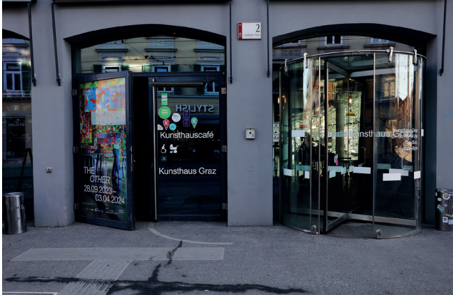
Main entrance Lendkai: Nr. 8