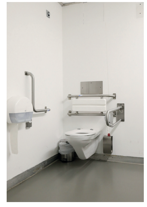
Barrier-free WC in the basement