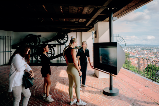
"Garden of Wonders"