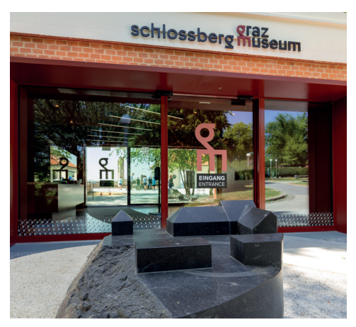
Touch model of the museum