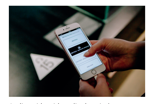
Audio guide with audio description