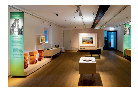
Exhibition area "Historical Trail"