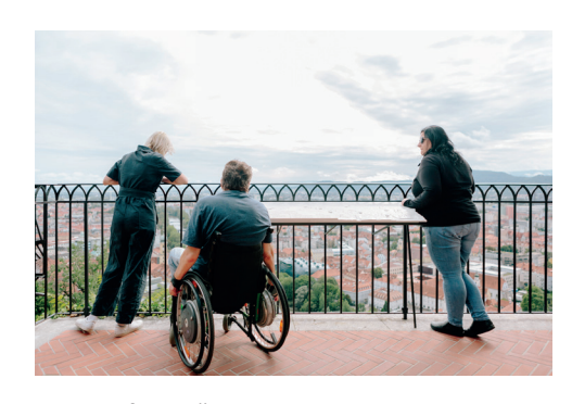
"View of Graz"