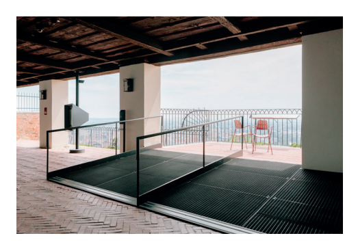
Ramp to the "View of Graz"