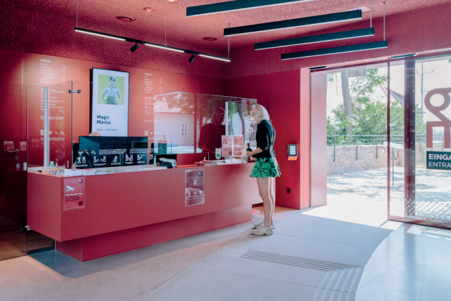
Access and entrance