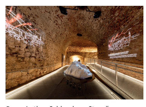
Ramp in the "Schlossberg Story"