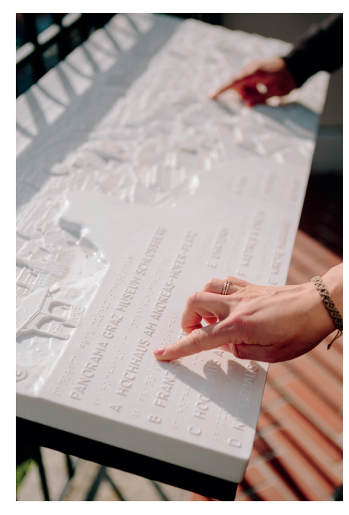
Touch model "View of Graz"