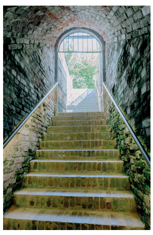
Stairs to "Schlossberg Story"