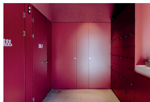
Access to barrier-free WCs and lockers