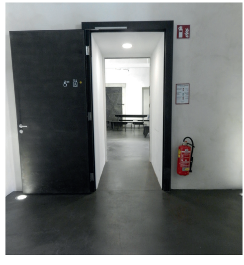
Access lift & WC, 4% gradient