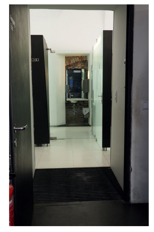
Access to WCs, 6% gradient