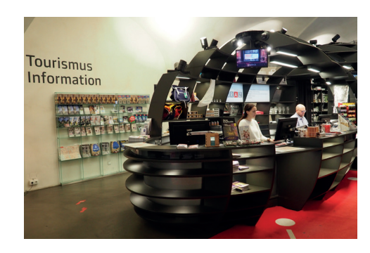
Cash desk tourist information