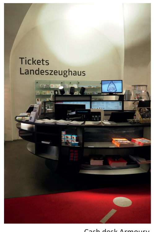
Cash desk Armoury