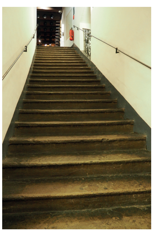
Stairs to exhibition area