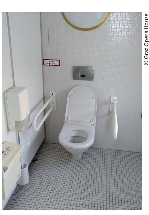
Accessible ladies toilet