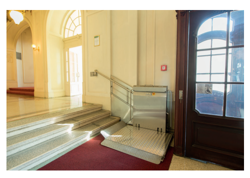
Steps and stair lift