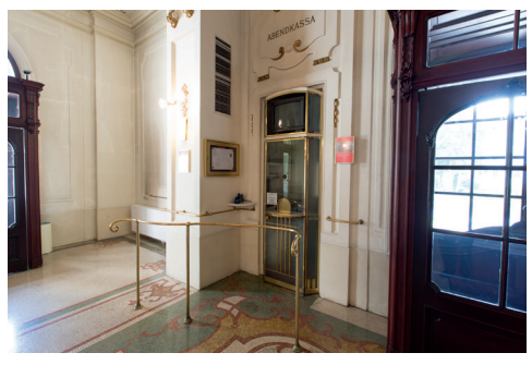
Evening box office