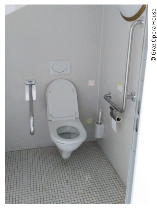
Accessible men's toilet (without description)