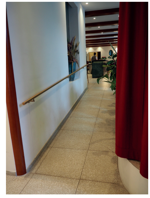
Ramp to bar