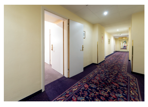
Access accessible room