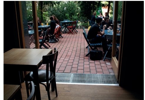
Access to terrace

Validity: April 2012, errors and omissions excepted, Graz Tourism in cooperation with Hartberg Disability Support Group