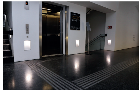
Lift and staircase to foyer and exhibition