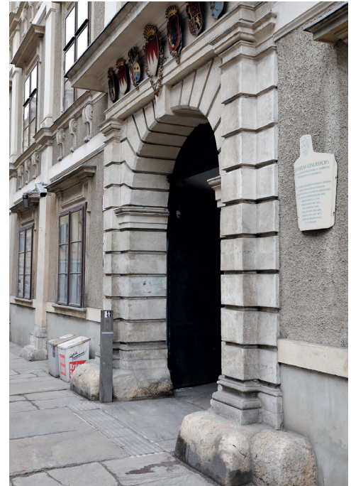
Access from Raubergasse with information stele for blind people