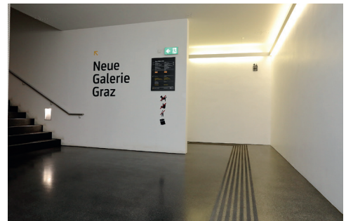
Staircase and access to lift