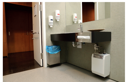
Barrier-free WC on the 2 nd basement