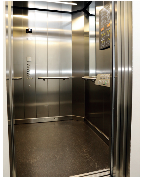
Lift from foyer to Neue Galerie