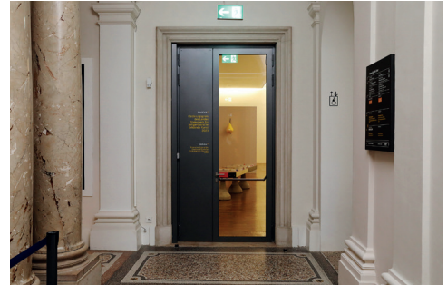
Door to exhibition area