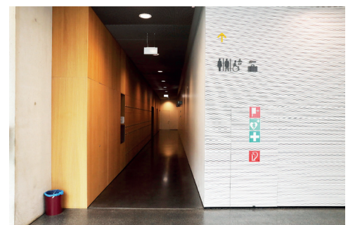
Lockers and access to WCs